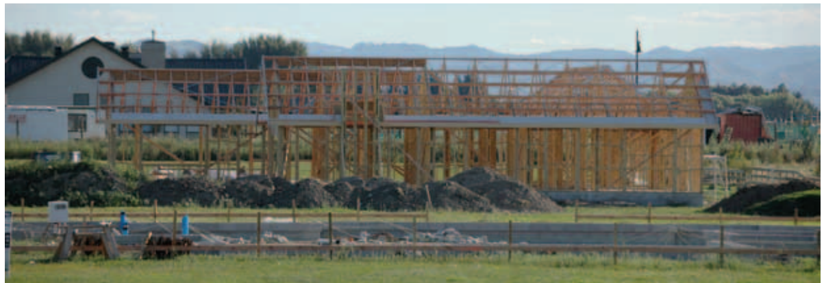
New construction continues around the city including here on the Back Ormond Road.

The rebates need to be applied for each rating year.