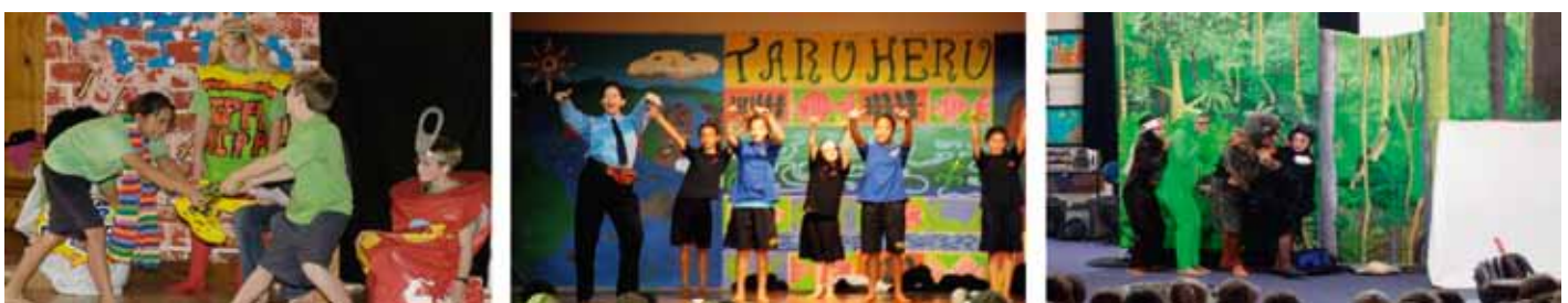
The Ilminster Intermediate "Green Team", performed a wonderful new environmental play to the students of 15 primary schools.