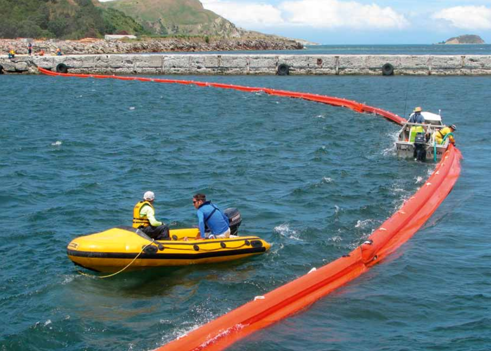
Above: Oil spill response training day in Gisborne Harbour.